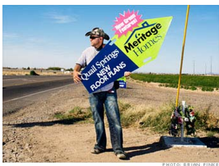
Drumming up sales

Two basic factors are laying the foundation for dramatic recovery in residential real estate. The first is the historic drop in new construction that so amazes Castleman. The second is a steep decline in prices, on the order of 30% nationwide since 2006, and as much as 55% in the hardest-hit markets. The story of this downturn has been an astonishing flight from the traditional American approach of buying new houses to an embrace of renting. But the new affordability will gradually lure Americans back to buying homes. And the return of the homeowner will start raising prices in many markets this year.