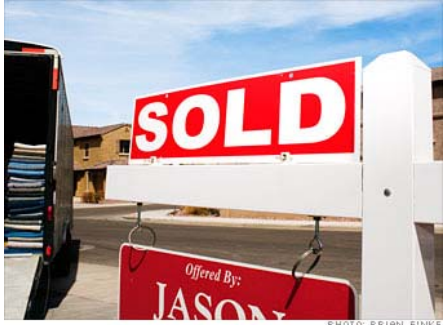
A home off the market in Mesa, Ariz.

The true disaster areas for housing since the bubble burst have been Sunbelt cities such as Las Vegas, Phoenix, and Miami -- places that boasted great job and population growth in the mid-2000s, only to suffer a housing crash that swamped them with empty homes and condos and crushed their economies. But people always want to live in those sunny locales, and their job markets are starting to recover, albeit slowly. In foreclosure markets the inventory problem is far greater because it includes not just traditional resale homes but millions of distressed properties. Fortunately those houses are now such a screaming deal that investors, including lots of mom-and-pop buyers, are purchasing them at a rapid pace. To be sure, some foreclosure markets won't rebound for years because they're both vastly overbuilt and far from big job centers; a prime example is California's Inland Empire, a real estate disaster zone 80 miles east of Los Angeles.