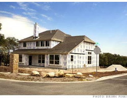
A home under construction in Austin. The number of new homes in

Forget stocks. Don't bet on gold. After four years of plunging home prices, the most attractive asset class in America is housing.